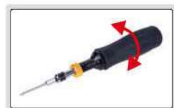
rotate the handle to set torque