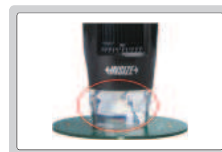
focus support ring